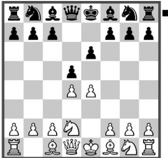
Position after: 3. \text{N}d2