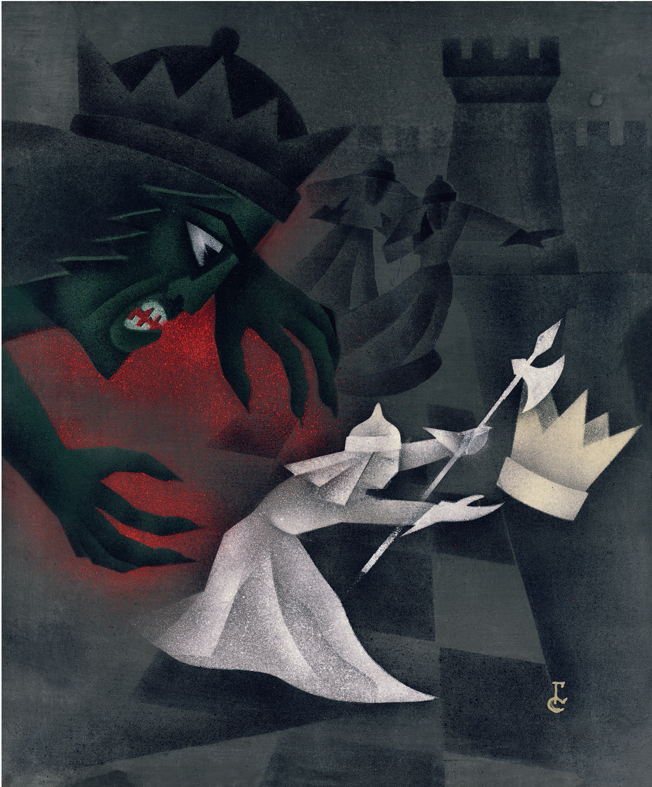
48. Racing to Queen . 1971. Cardboard, oil, splatter. 36x30.